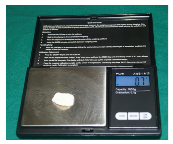
Figure 6: Chewed gum weighed after desiccation

collection time was recorded using a stopwatch. The test was repeated in the same manner after 6 months.