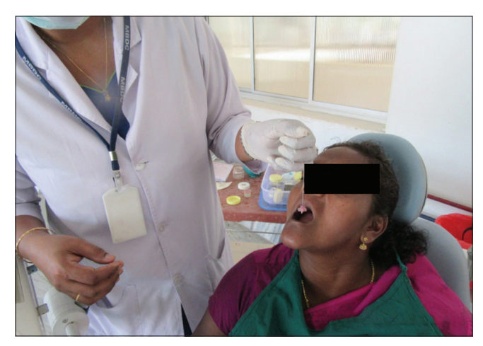
Figure 3: Introduction of test forms to the subject

Unstimulated salivary flow rate was estimated by measuring the time taken to collect 5 ml of the whole saliva. Saliva is said to be "unstimulated" when no exogenous stimulation by mechanical or pharmacological agents is present. The saliva was collected using the spitting method, as this is considered the most reproducible method. After rinsing the mouth with water, saliva was allowed to accumulate in the floor of the mouth and repeatedly expectorated into a graduated measuring jar to collect 5 mL [Figure 7]. The