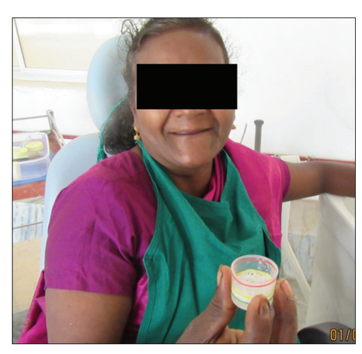
Figure 7: The subject with a collected saliva sample

Hence, the minimum sample size required at 6 months after denture usage is 31. Expecting 50% dropout at 6 months after denture usage, the sample required initially is 62 rounded to 70.