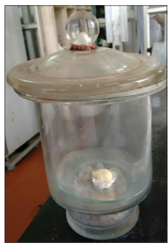
Figure 5: Chewed gums kept in a desiccator for 24 h for drying